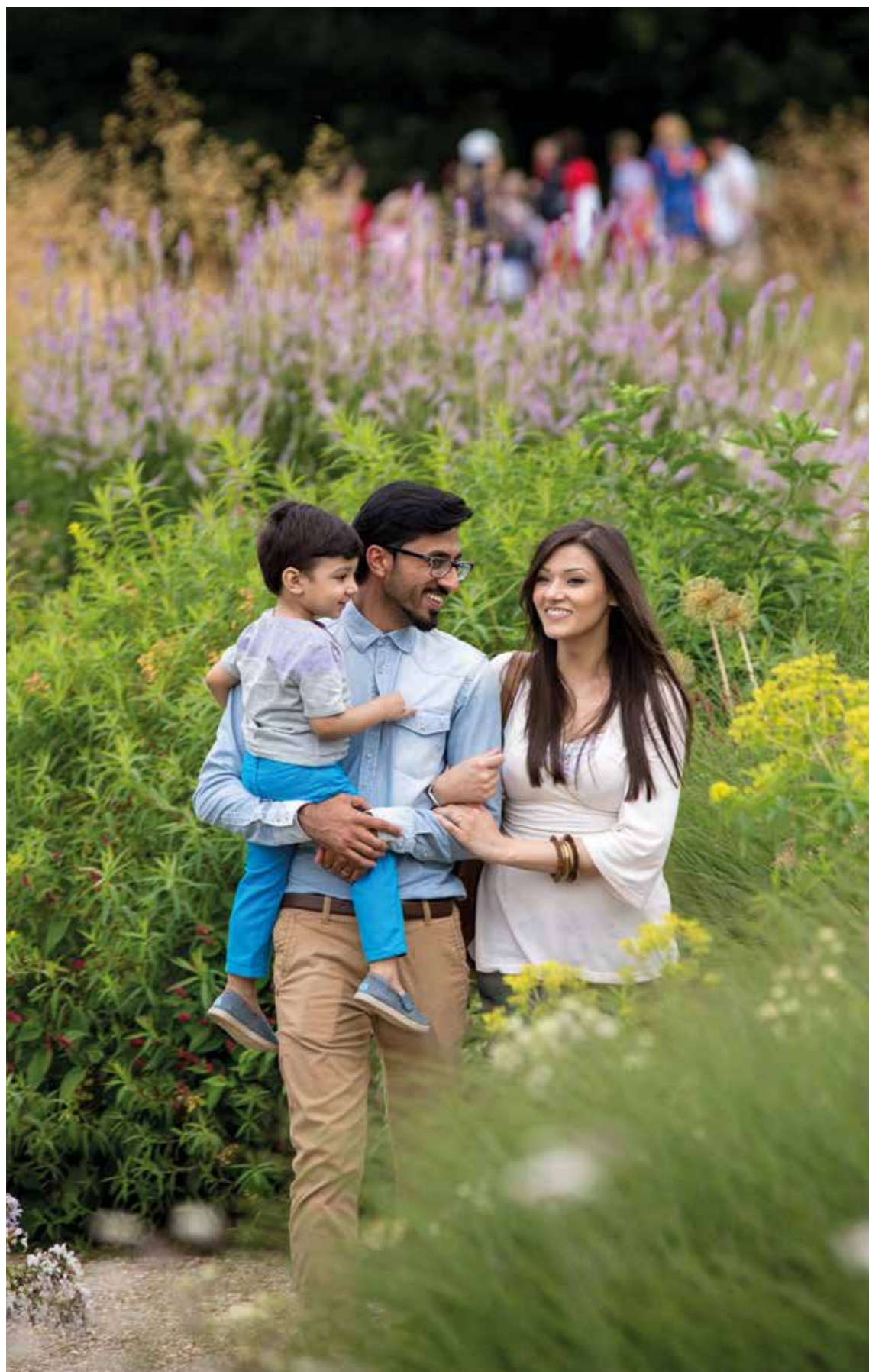
Floral Labyrinth, part of the gardens at the Trentham Estate.

the new affordable housing that is needed and will work closely with private sector landlords to ensure our residents can live in good quality, safe homes.