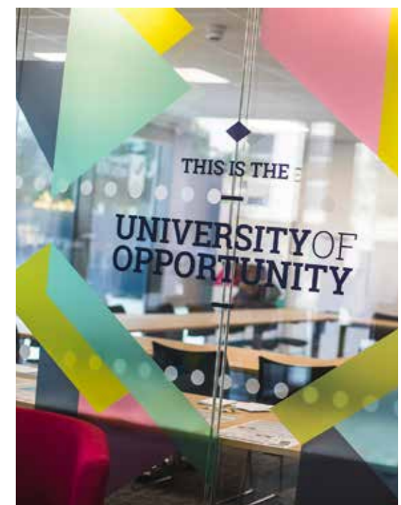
The University of Wolverhampton Regional Centre for Lifelong Learning is based puts education in the heart of Stafford.