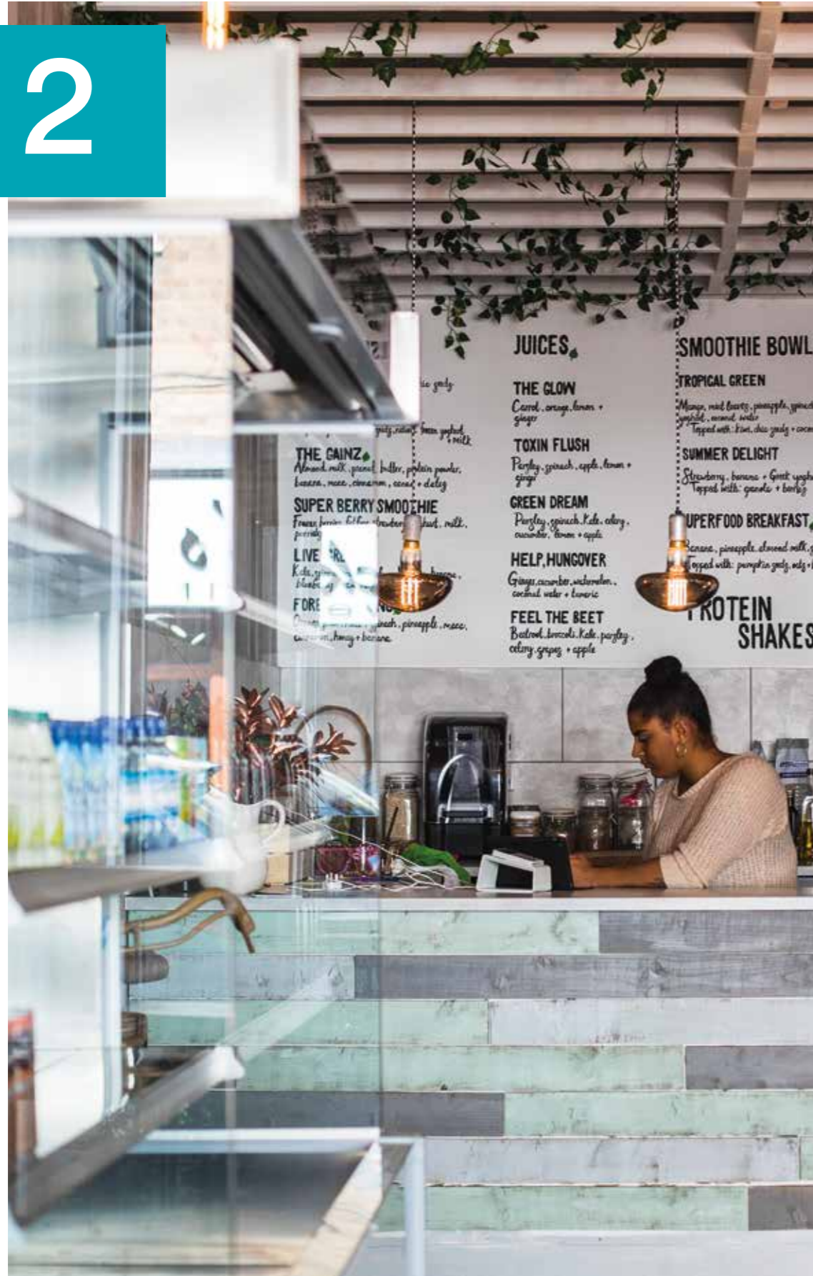
Roar Juice, smoothie and juice bar in Mill Street, Stafford.