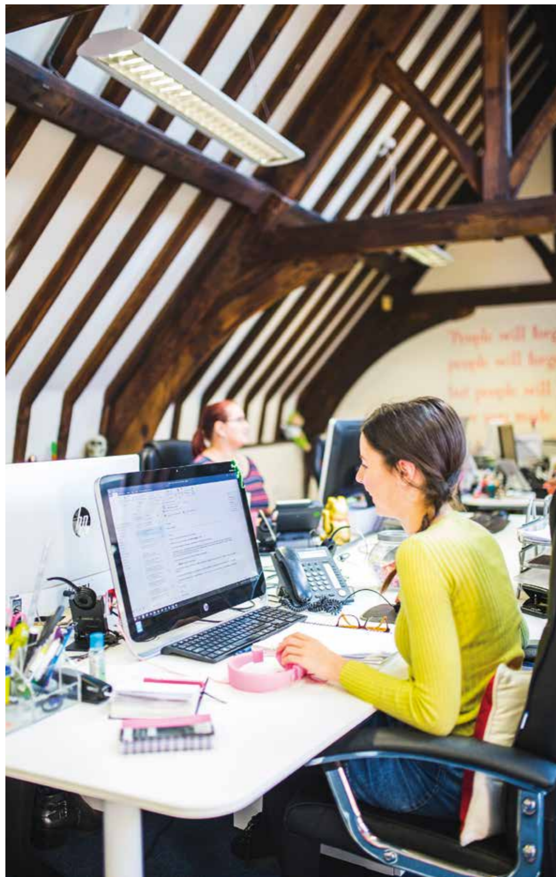
Stone Junction, PR company based in St Mary's Mews, Stafford.