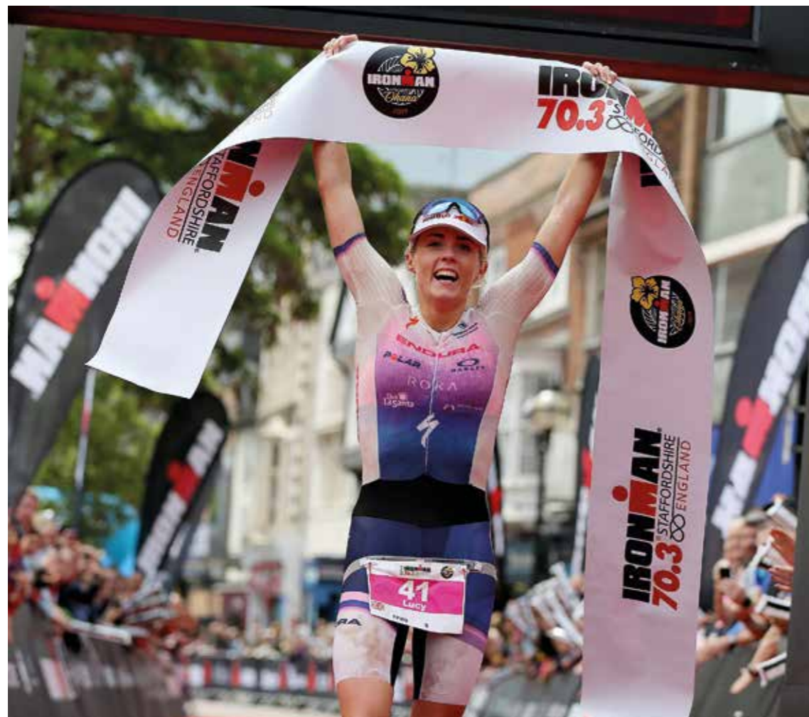
Ironman 70.3 triathlon in Staffordshire attracts nearly 8,000 competitors and finishes in Market Square, Stafford.