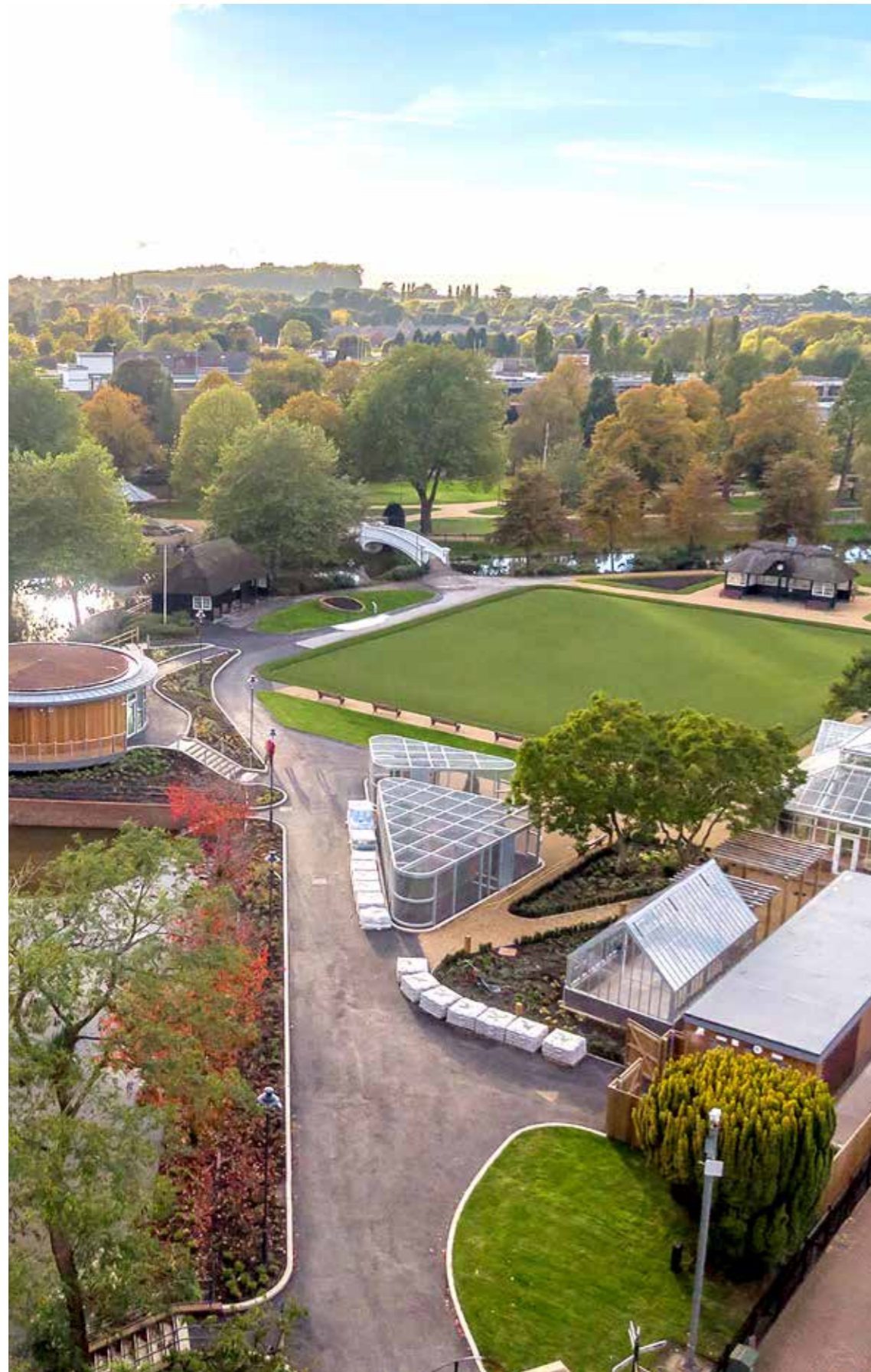
Award winning Victoria Park in Stafford Town Centre has undergone a £2.5m transformation.