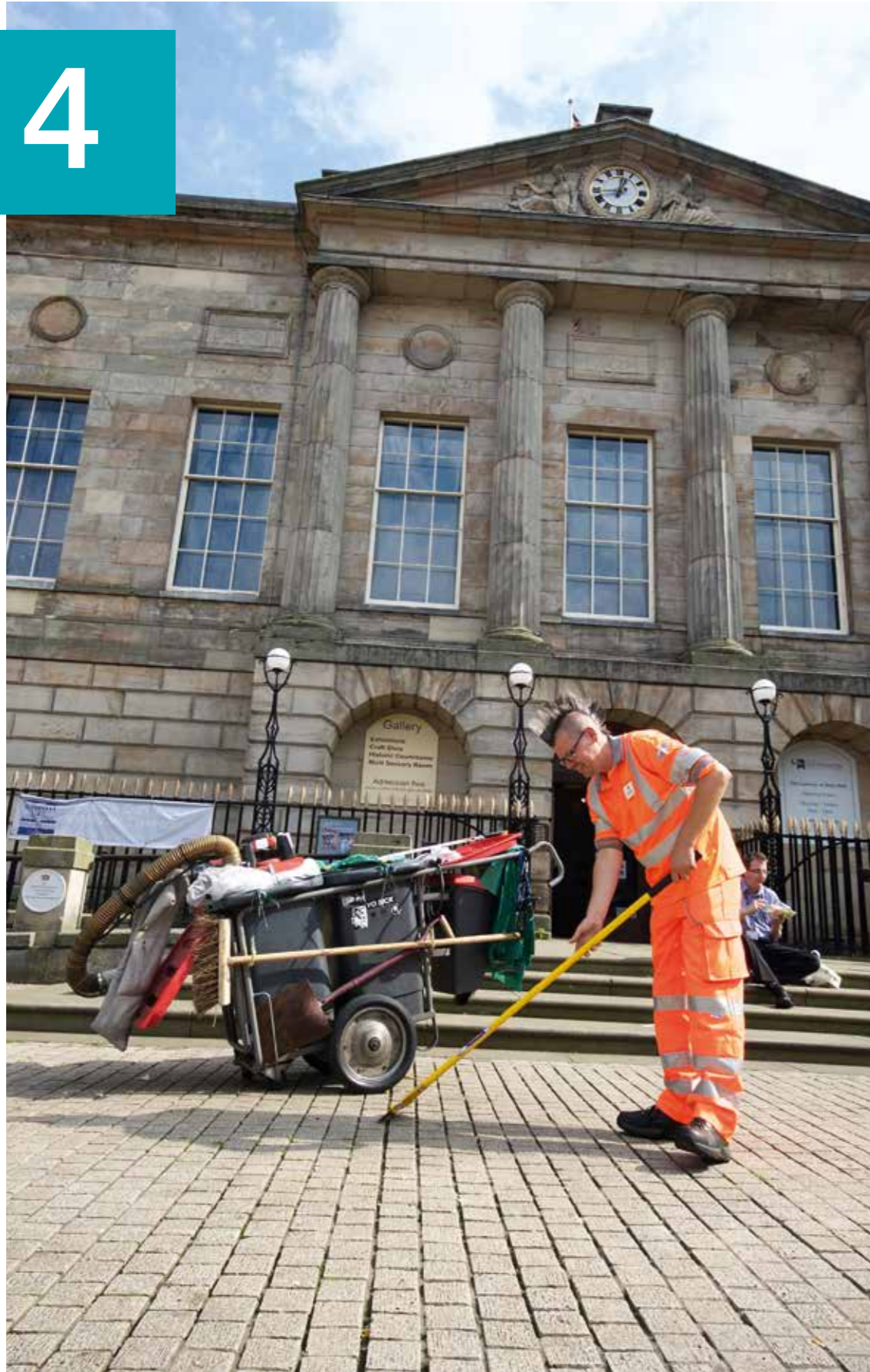
Our Streetscene team keep the borough clean and attractive.