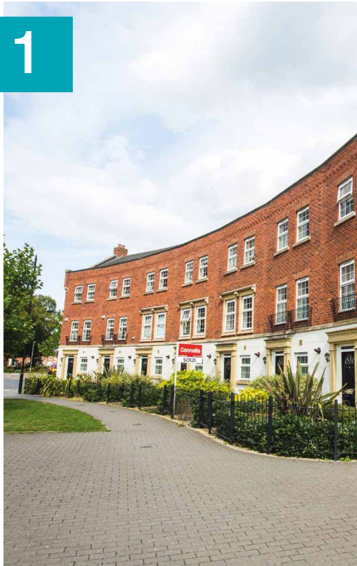
St George's Mansions, St. George's Parkway, Stafford.