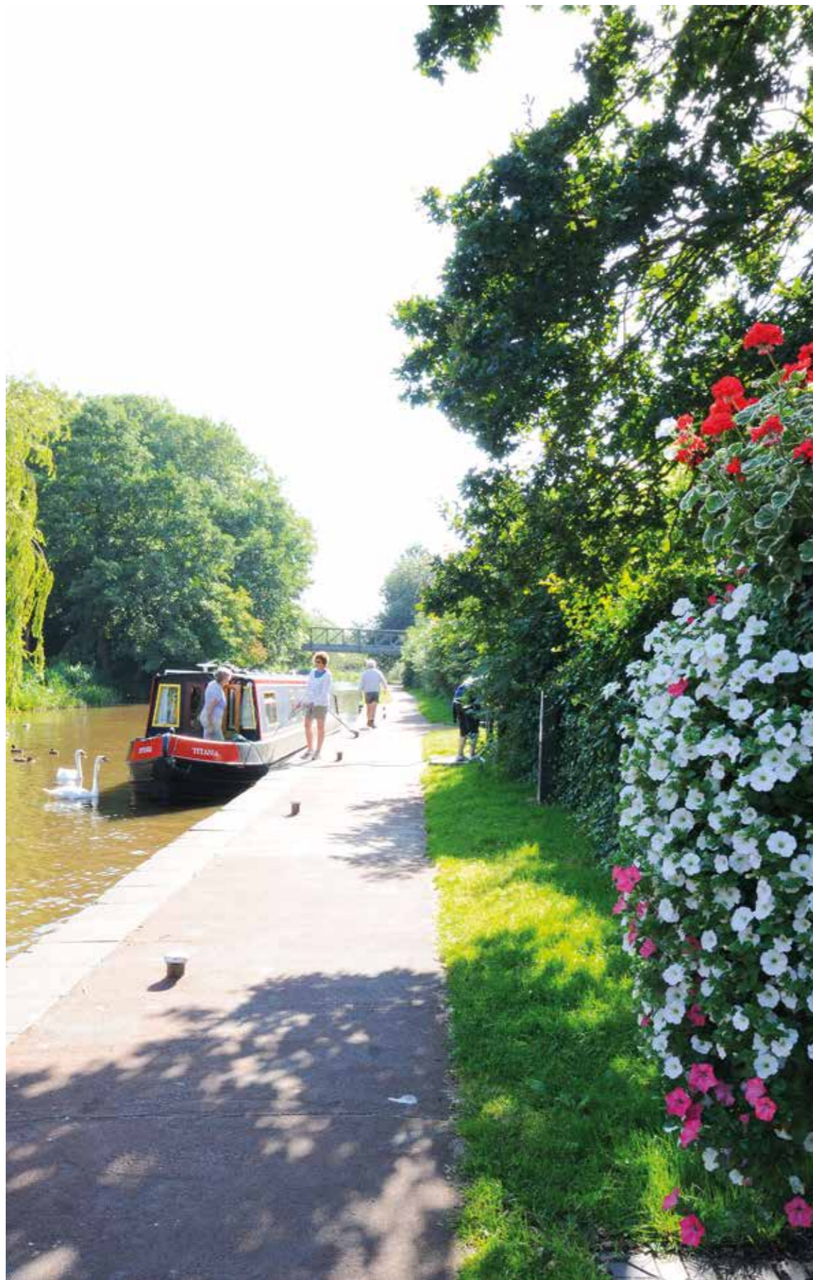
Stone canal, an ideal base for canal boat holidays and discovering the many visitor attractions in the borough.