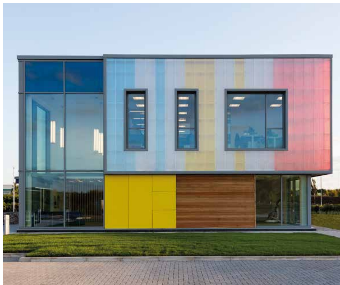
Omicron, Redhill Business Park.