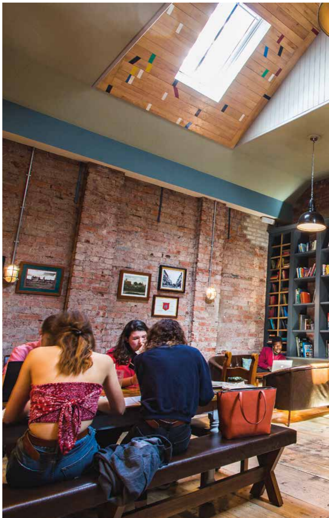
Coffee#1 serving great coffee in a relaxed and welcoming environment.

During the past three years the council has been commended nationally for their work on homelessness and rough sleeping through the introduction of innovative approaches such as setting up a multi-agency inclusion team, developing single support plans with rough sleepers to get them into accommodation and receiving funding for a dual diagnosis worker. The dual diagnosis worker will support rough sleepers with mental health and multiple addiction needs. The council funds two tenancy sustainment officers who provides intensive support to prevent homelessness from occurring and to help get people into sustainable tenancies.