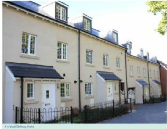
A typical Bellway home

Stafford Borough Council is seeking to deliver at least 10,100 new homes in the borough by 2031.