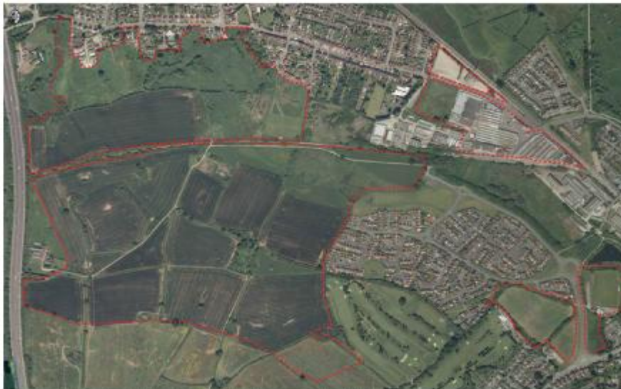
The development site is outlined in red. It is located between Stafford Gate to Staff Clay to the south and Doney Road to the north.

This public exhibition gives you the opportunity to view and comment upon a concept plan for a mixed use residential development at Land West of Stafford, outlined in red on the aerial photo below.