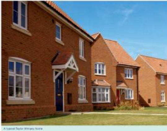
A typical Taylor Wimpey home