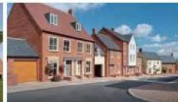
Satellite image from Google.co.uk