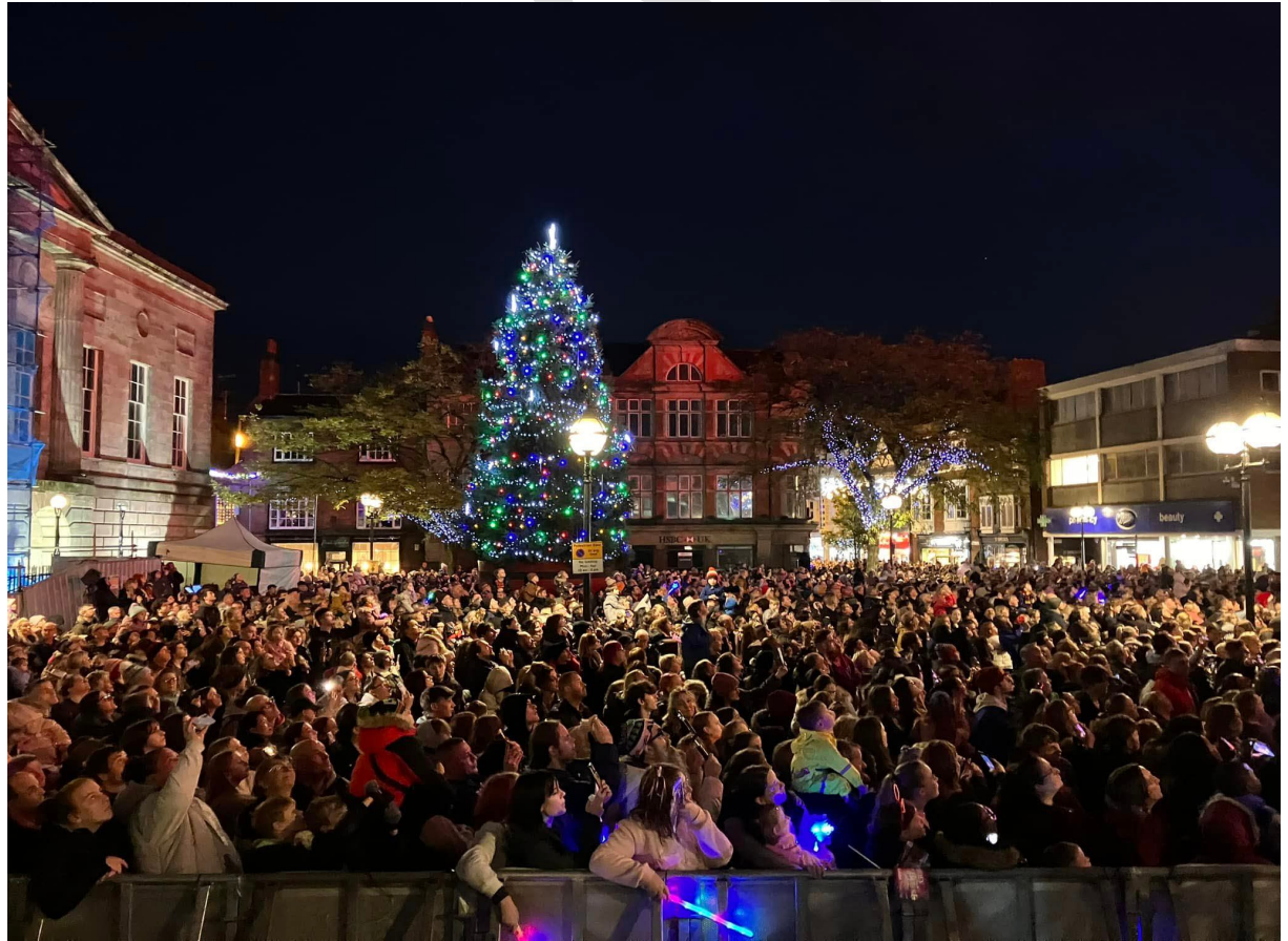
Christmas light switch on