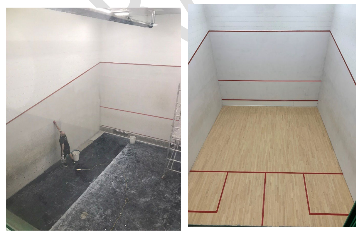
Squash Court Before and After Images