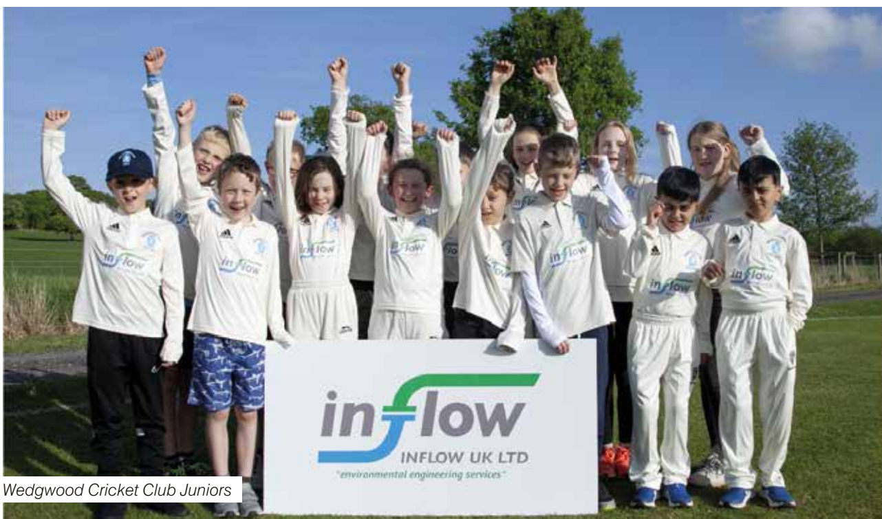
Wedgwood Cricket Club Juniors