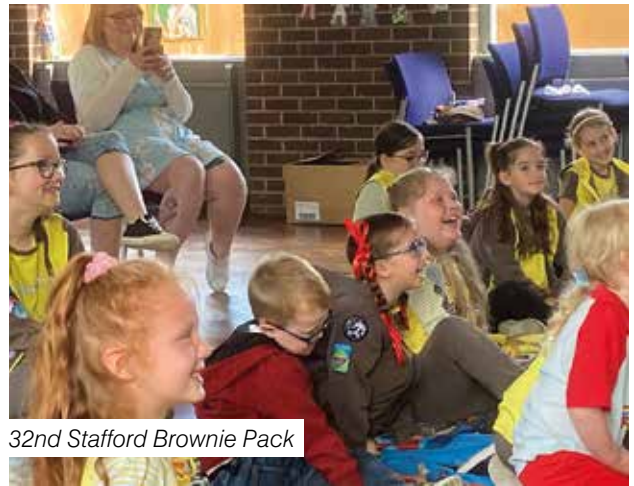
32nd Stafford Brownie Pack