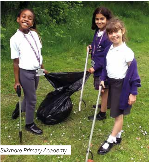
Silkmore Primary Academy