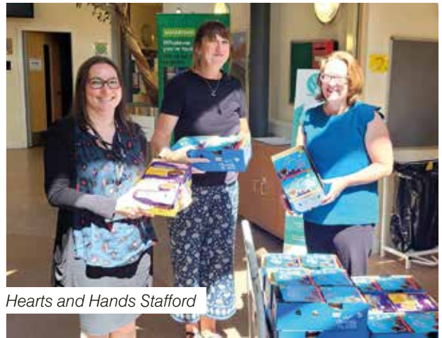
Hearts and Hands Stafford