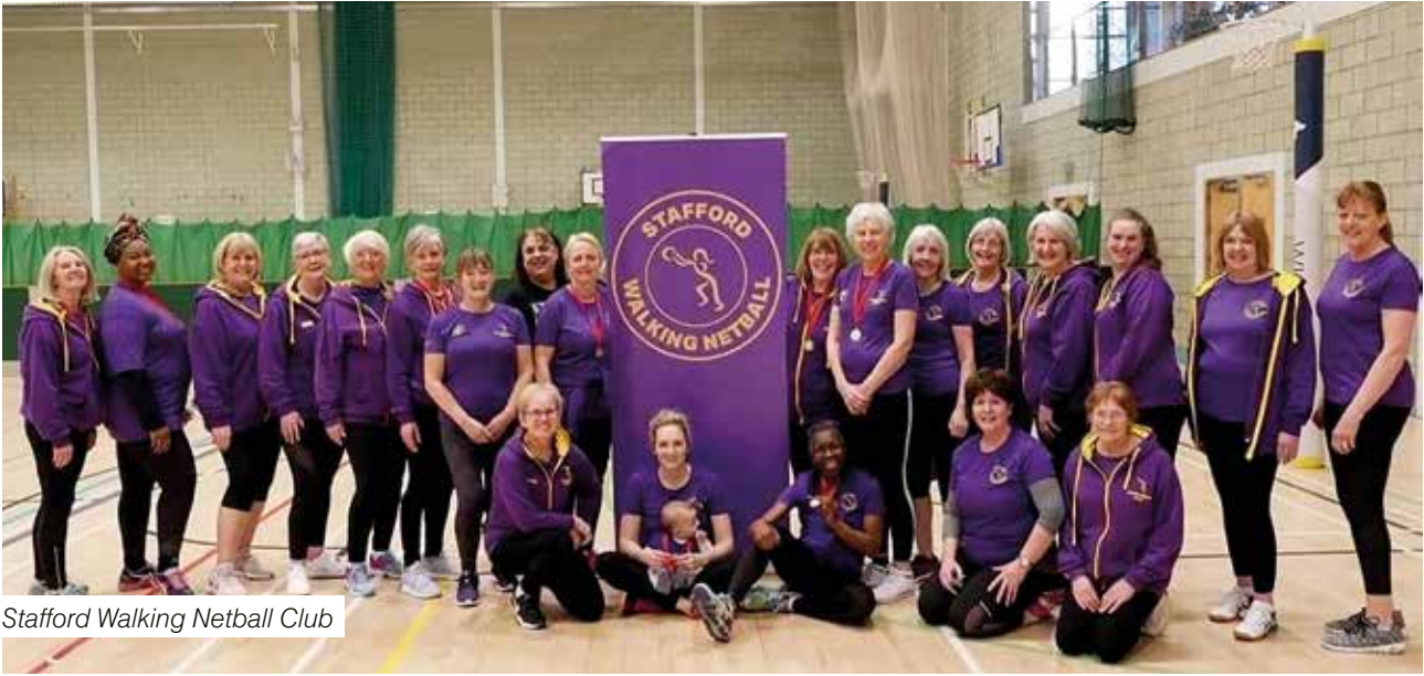
Stafford Walking Netball Club