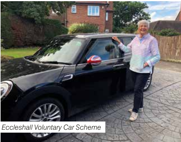
Eccleshall Voluntary Car Scheme