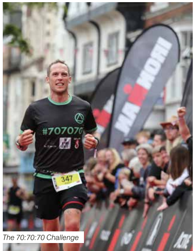
The 70:70:70 Challenge

There are 67 staff at the depot ranging from the collection crews through to administration and management. The collection crews play an important part in the community and sometimes they are the only people that some of the more isolated residents see. The crews have helped vulnerable residents, administered first aid, and called ambulances where needed. This social responsibility is something that the crews take pride in and they wanted to be able to do more and give back to the local community where they could. The crews and staff started to collect food items for local charities. They have raised 7k for charity by collecting real Christmas trees and have arranged around 450 Christmas selection boxes and easter eggs. As well as food they also collect toiletries, books, colouring pencils etc to distribute to families in need. They start gathering items in September and deliver in early December for pre-Christmas distribution.