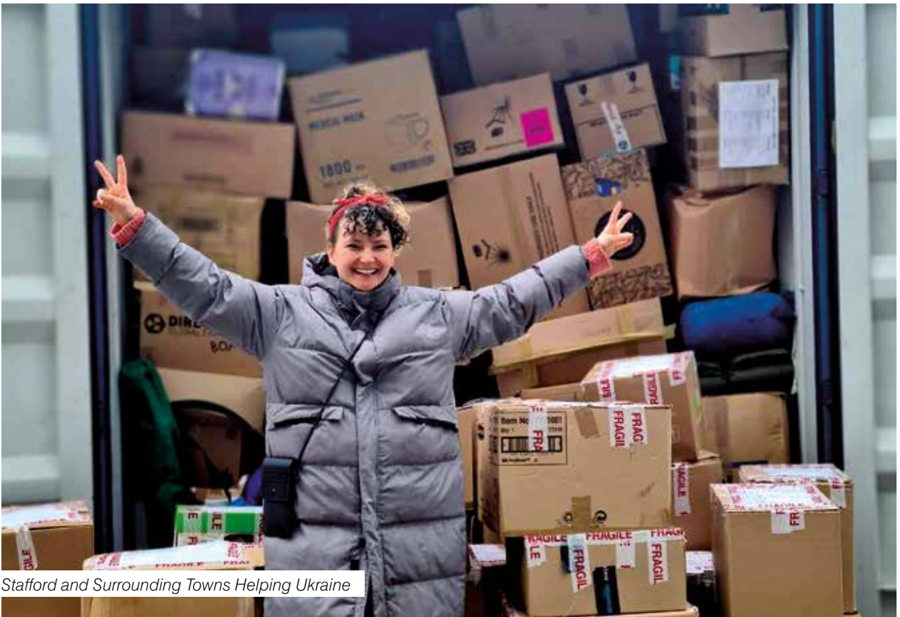
Stafford and Surrounding Towns Helping Ukraine