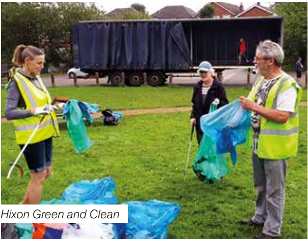
Hixon Green and Clean