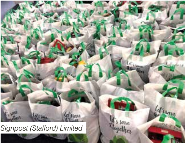
Signpost (Stafford) Limited