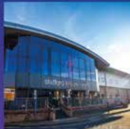
Stafford Leisure Centre