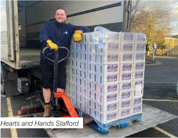
Hearts and Hands Stafford