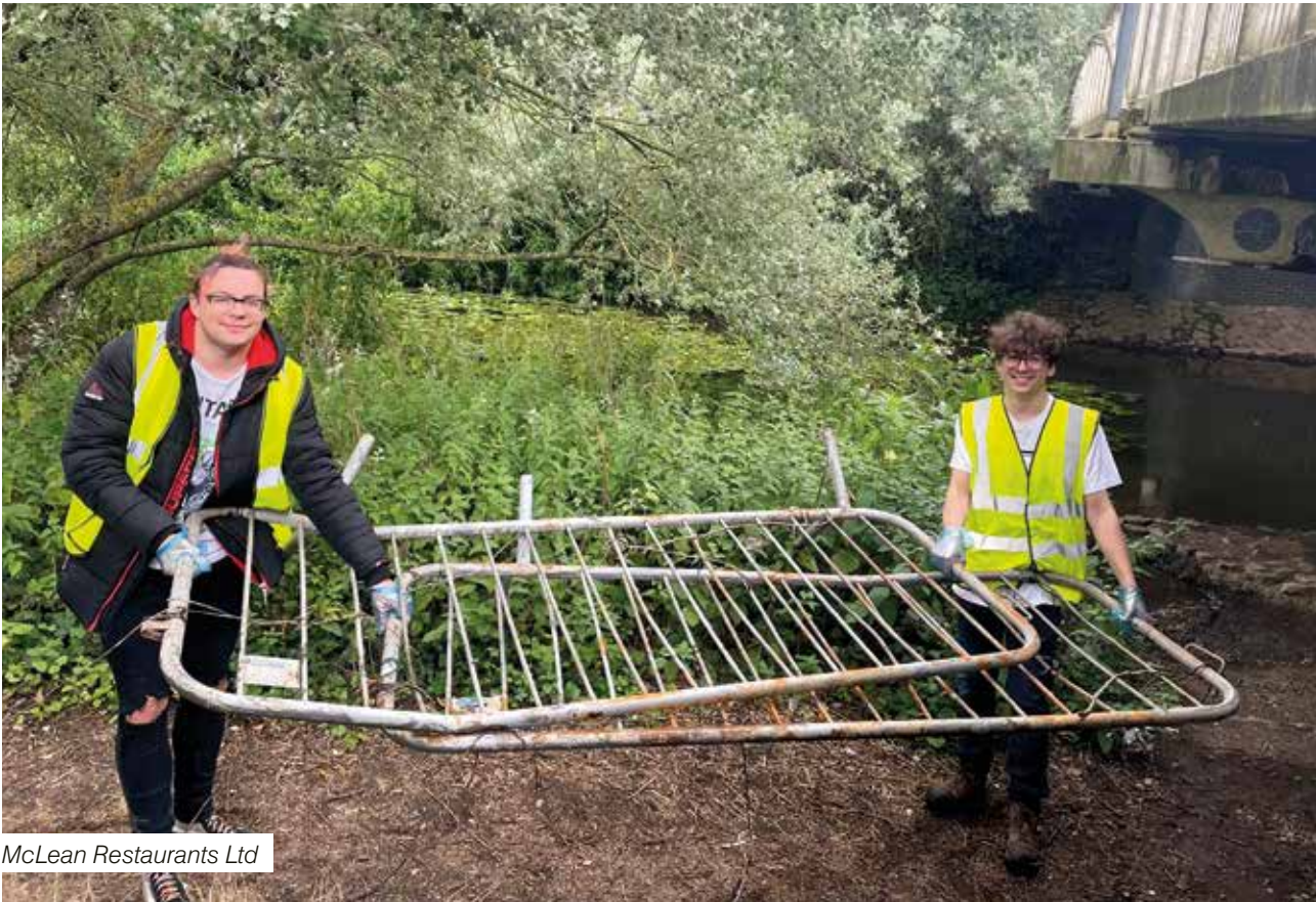
McLean Restaurants Ltd