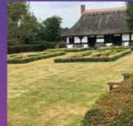
Izaak Walton's Cottage

Inspiring healthy communities through leisure & culture within Stafford Borough