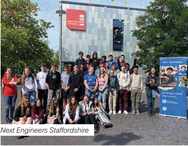
Next Engineers Staffordshire