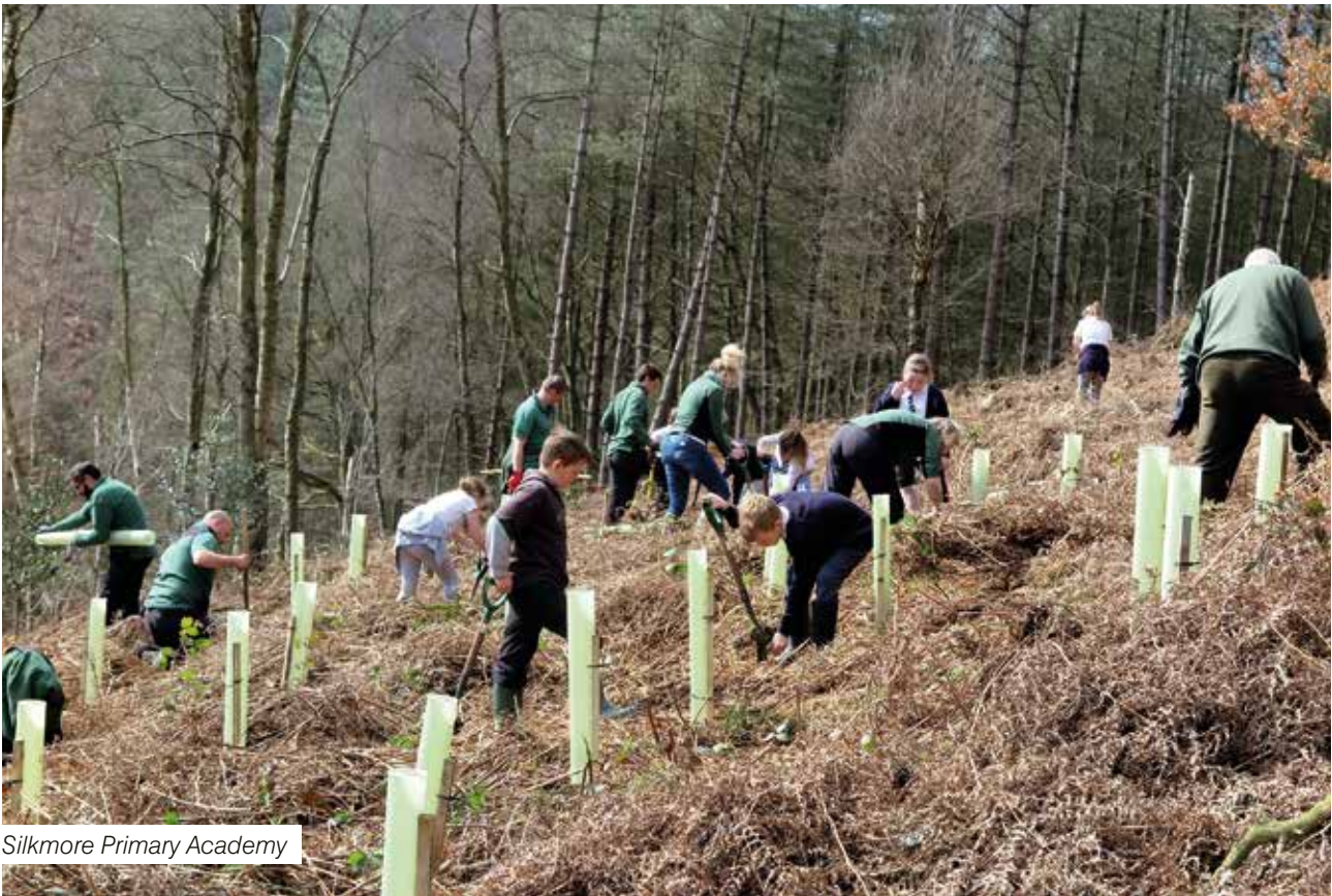
Silkmore Primary Academy