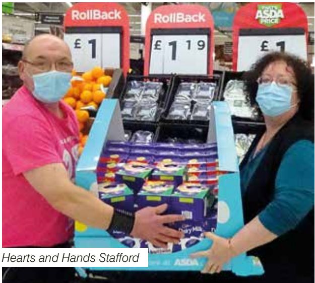
Hearts and Hands Stafford