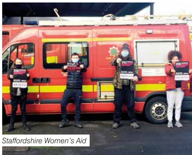
Staffordshire Women's Aid

The 32nd Brownie pack wanted to provide a free safe environment for the Brownies to enjoy a Jubilee Street party as some of the families struggle for money and extra activities are not something they can normally afford. The event allowed all Brownies to attend free of charge, they provided some fantastic food, a magician, table decorations and a small gift which they could treasure. The run up to the party saw the girls make many jubilee crafts and decorations. The leaders created a cardboard cut-out of our late queen and guards for photo opportunities. The event is something that hopefully the girls will remember for a long time and the lasting memory will be one of being able to spread a little joy to those who were struggling.