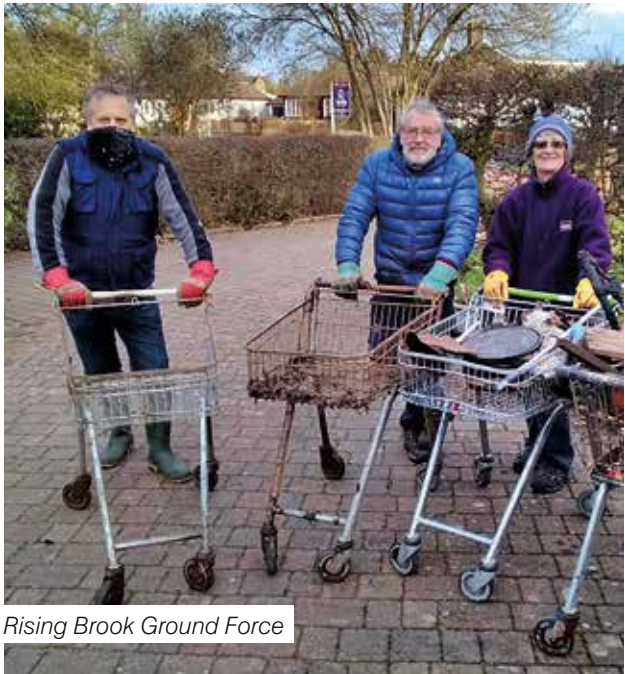
Rising Brook Ground Force