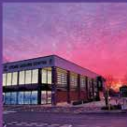
Stone Leisure Centre