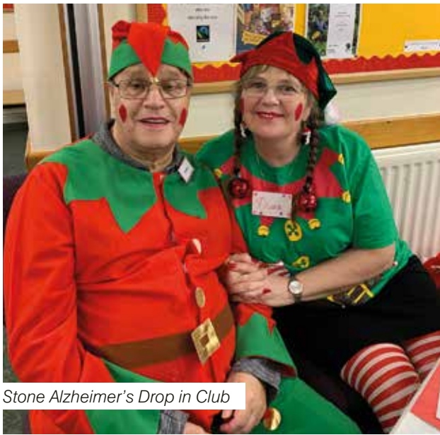
Stone Alzheimer's Drop in Club