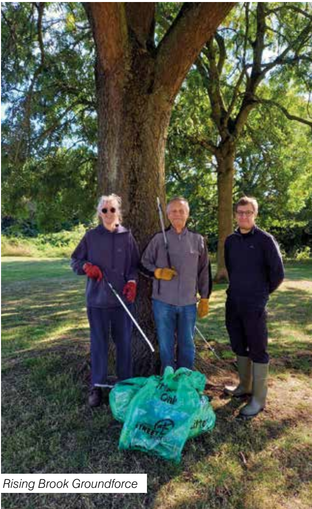
Rising Brook Groundforce