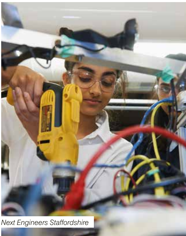
Next Engineers Staffordshire

The GE Foundation's Next Engineers project is running across Staffordshire and has been designed to inspire local students aged 13-18 into pursuing a career in engineering. Next Engineers launched three successful programmes over the last year, Engineering Discovery, Engineering Experience and Engineering Academy, each offering a tailored learning experience and approach for students. The programme is designed to take engineering essentials and apply them in real-world scenarios, with a wider aim of ensuring the programme is available to all students, no matter of background, the experience is completely free of charge. The three programmes have been designed to introduce all students in the region to the world of engineering and support them in making engineering a viable career option. By investing in the talent of tomorrow, GE believes the Staffordshire-based students can help lead the next generation towards a smarter, greener future, and help develop the local community.