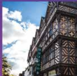
Ancient High House