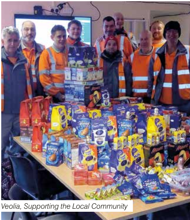
Veolia, Supporting the Local Community