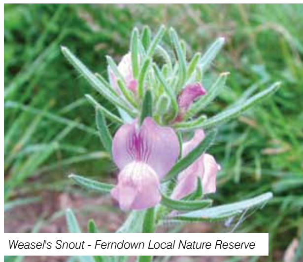
Weasel's Snout - Ferndown Local Nature Reserve

Located at the back of this document our Action Plan set out the methods by which we intend to carry out our biodiversity programme of works. The Action Plan has three sections reflecting the objectives of this Strategy. Where there is an external action the Biodiversity Steering Group will monitor it. Where there is an internal action, the Environmental Management Steering Group will monitor and report it. This will be on a quarterly basis.