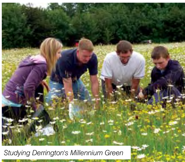
Studying Derrington's Millennium Green

We encourage community involvement on our Local Nature Reserves some of which now have active 'Friends of' groups such as Astonfields and Ferndown.