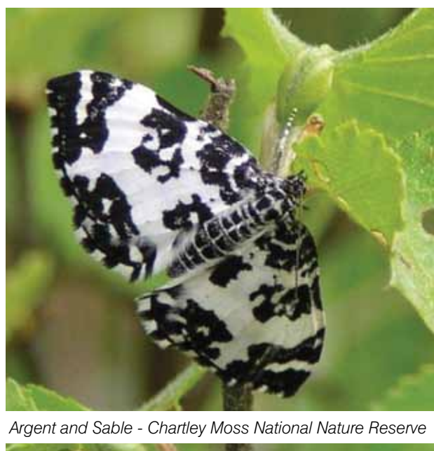
Argent and Sable - Chartley Moss National Nature Reserve

This attractive area is managed for its marsh and includes uncommon plants like Wood Club-Rush, Tussock Sedge and Water Figwort. The habitat attracts many butterflies and dragonflies.