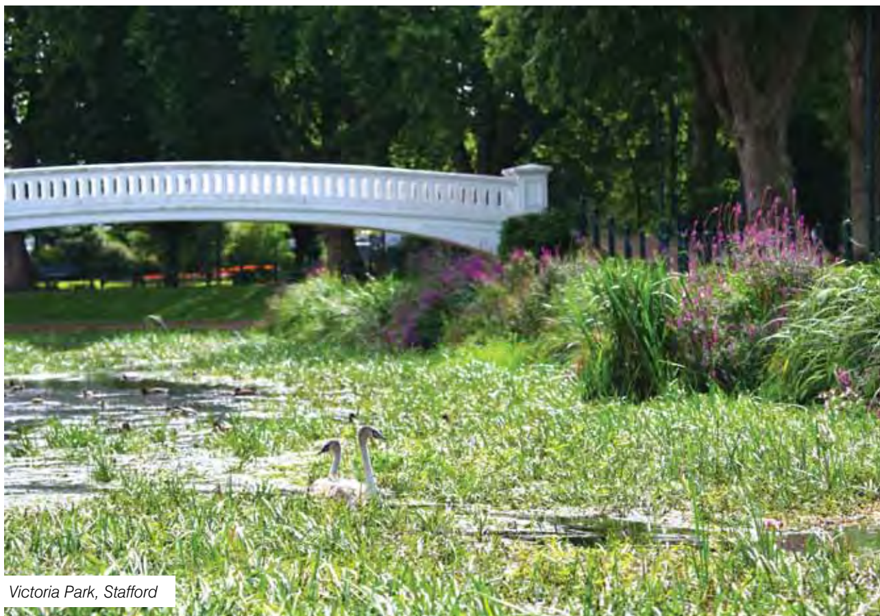
Victoria Park, Stafford

Many people prefer to see rivers with no aquatic channel vegetation. To undertake a programme of removal however would reduce the biodiversity of the river by removing natural spawning and shelter sites, reducing the insect, bird and fish populations.