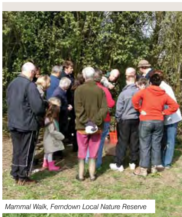
Mammal Walk, Ferndown Local Nature Reserve