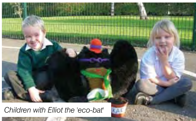
Children with Elliot the 'eco-bat'

Children, parents, helpers and staff planted an orchard in the school grounds recently, to encourage wildlife, healthy eating, local food production and help understand the concept of 'food miles'.