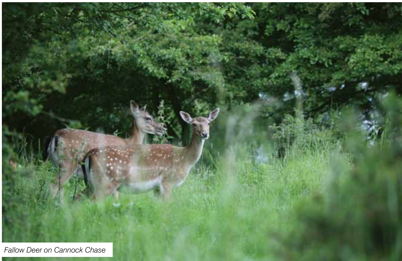
Fallow Deer on Cannock Chase

There are great pressures on Stafford Borough's wildlife including intensification of agriculture and development. Added to this is the unpredictable effect of climate change. It is more important than ever that we continue to help create a coherent and connected natural landscape that favours wildlife and helps assure its future wellbeing.