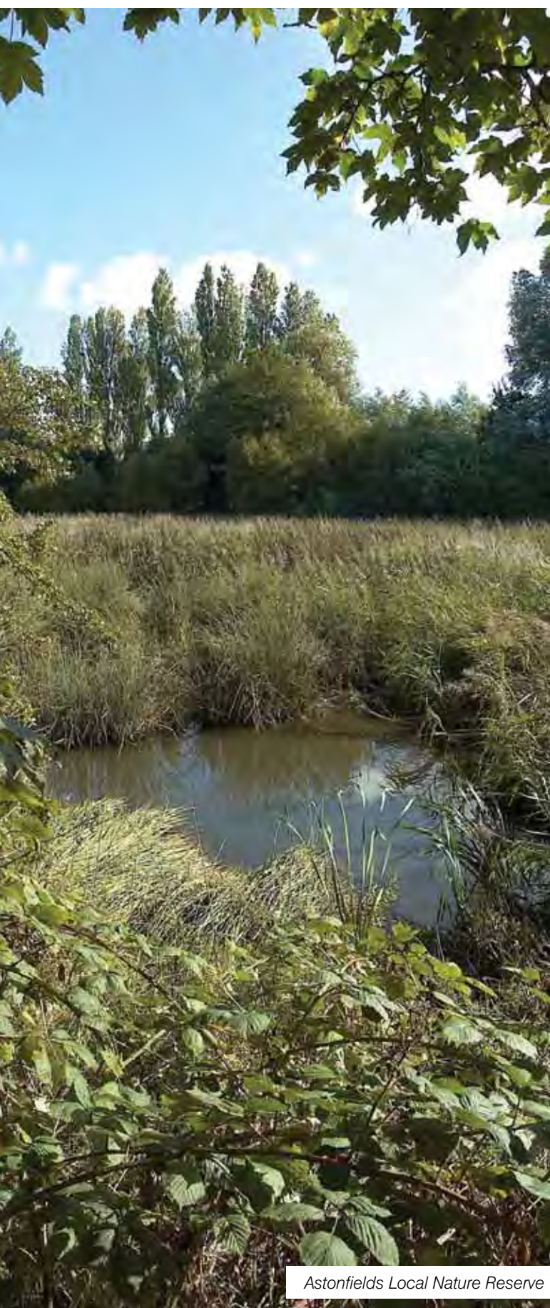
Astonfields Local Nature Reserve