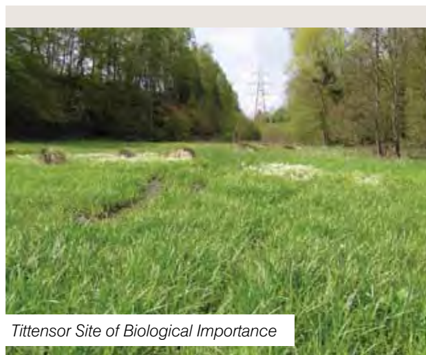
Tittensor Site of Biological Importance

SBIs are assessed against set criteria by a panel belonging to Staffordshire Wildlife Sites Partnership, comprised of members of relevant organisations and hosted by Staffordshire Wildlife Trust. Most of the council's own SBIs are already designated as Local Nature Reserves however there are two sites that are managed differently for their biodiversity. Both these sites are in a Higher Level Stewardship agreement that pays for annual management. The Council worked in partnership with the Wildlife Trust and Natural England to achieve this.