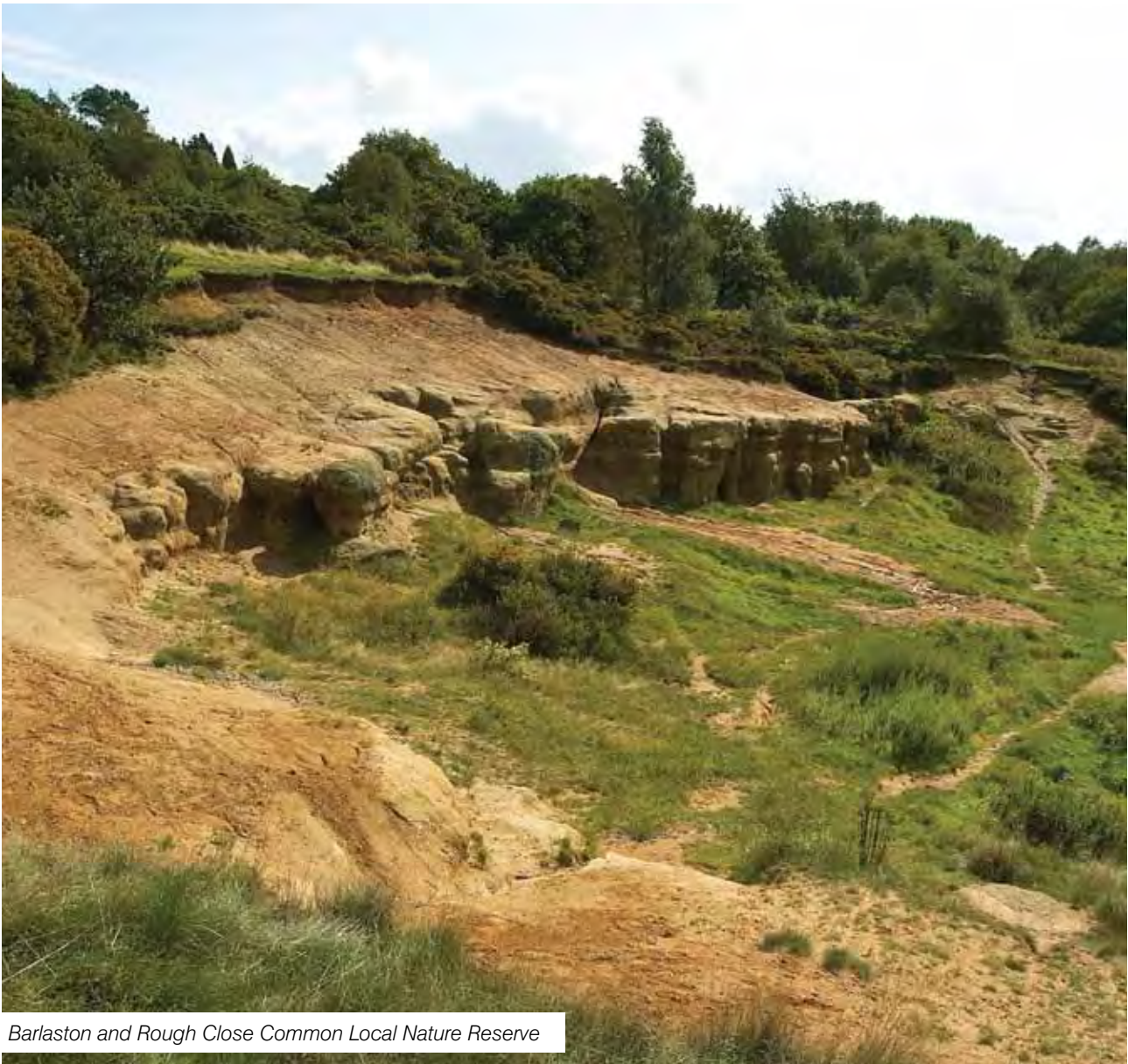
Barlaston and Rough Close Common Local Nature Reserve

It is an opportune time to revisit and renew the Council’s Biodiversity Strategy with the hope that we can continue to conserve the Borough’s natural resources for present and future generations.