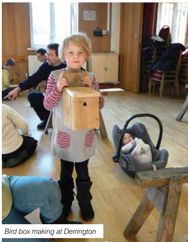
Bird box making at Derrington

There are also several things to avoid using including pesticides and herbicides. There are now good alternatives to peat - whose continued harvesting is damaging the environment.