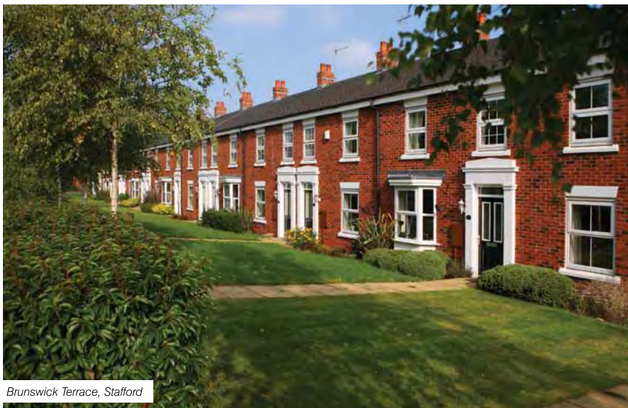
Brunswick Terrace, Stafford

A leaflet entitled, Biodiversity and your Planning Application was produced by the Council and can be found on the council's website in the Biodiversity section www.staffordbc.gov.uk/biodiversity-and-nature-conservation