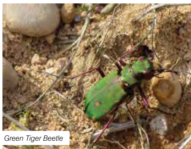
Green Tiger Beetle