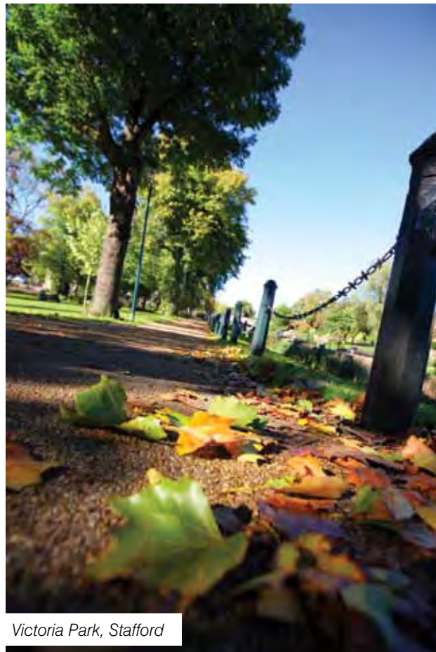
Victoria Park, Stafford

For more information on the Council's Parks and Open Spaces download a copy of the Park Life Brochure at www.staffordbc.gov.uk/parks