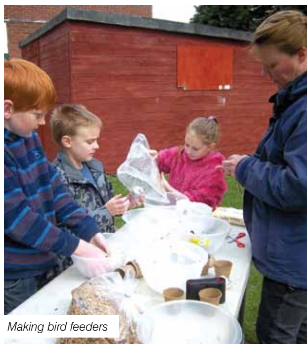
Making bird feeders