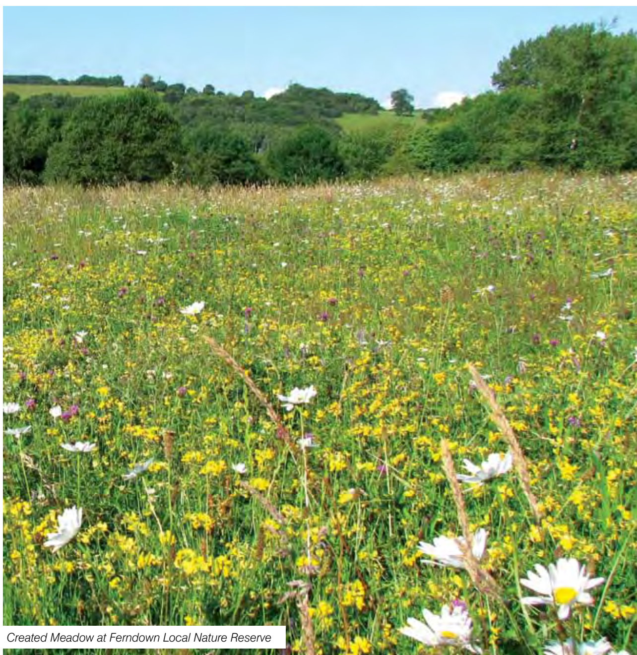
Created Meadow at Ferndown Local Nature Reserve

We know we are losing our biodiversity with many species of animals and plants decreasing in the UK and across the world. It is becoming clear that only through coordinated policy and action will we halt these losses. It is now more important than ever that we conserve and enhance what remains.