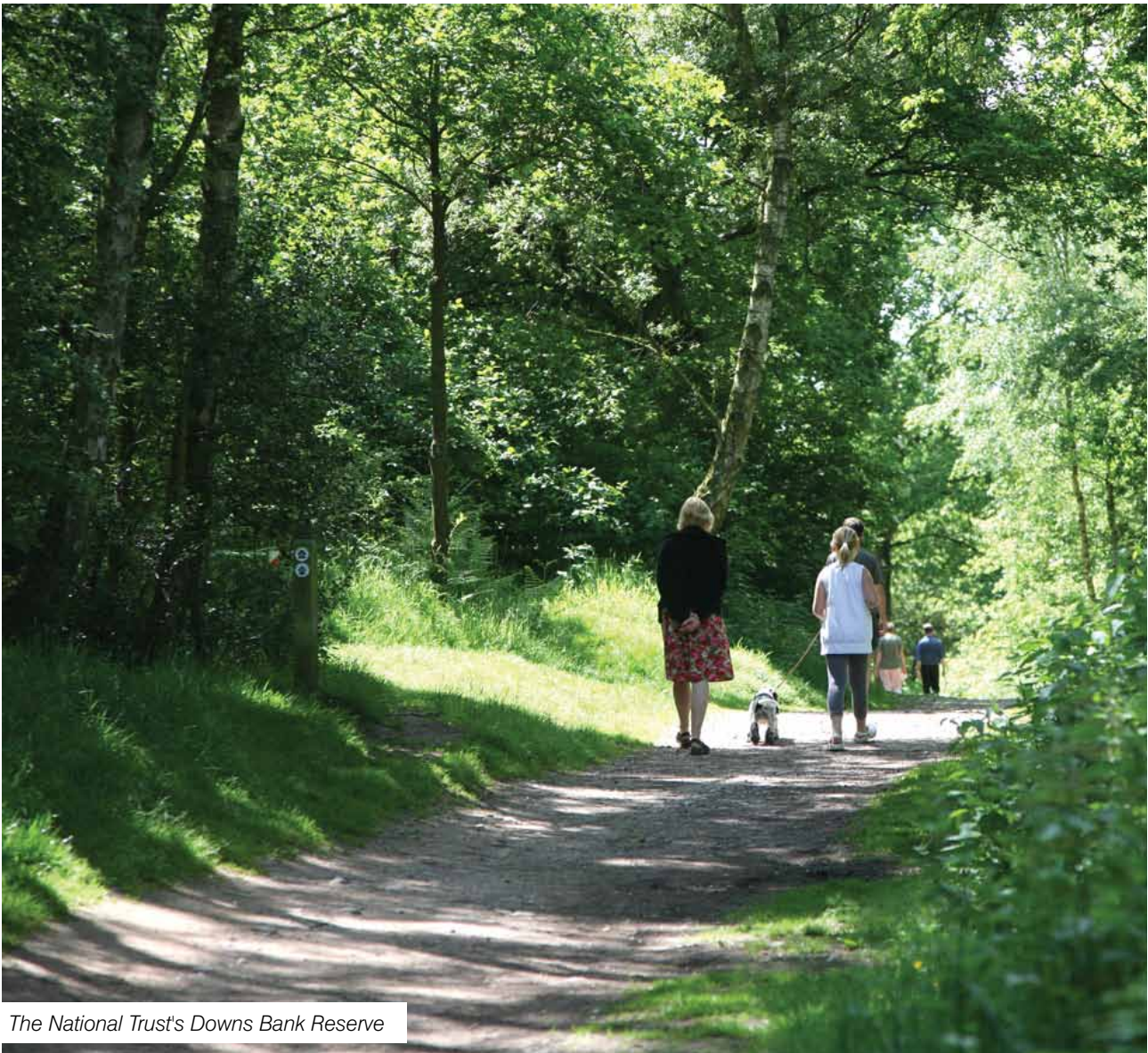
The National Trust's Downs Bank Reserve