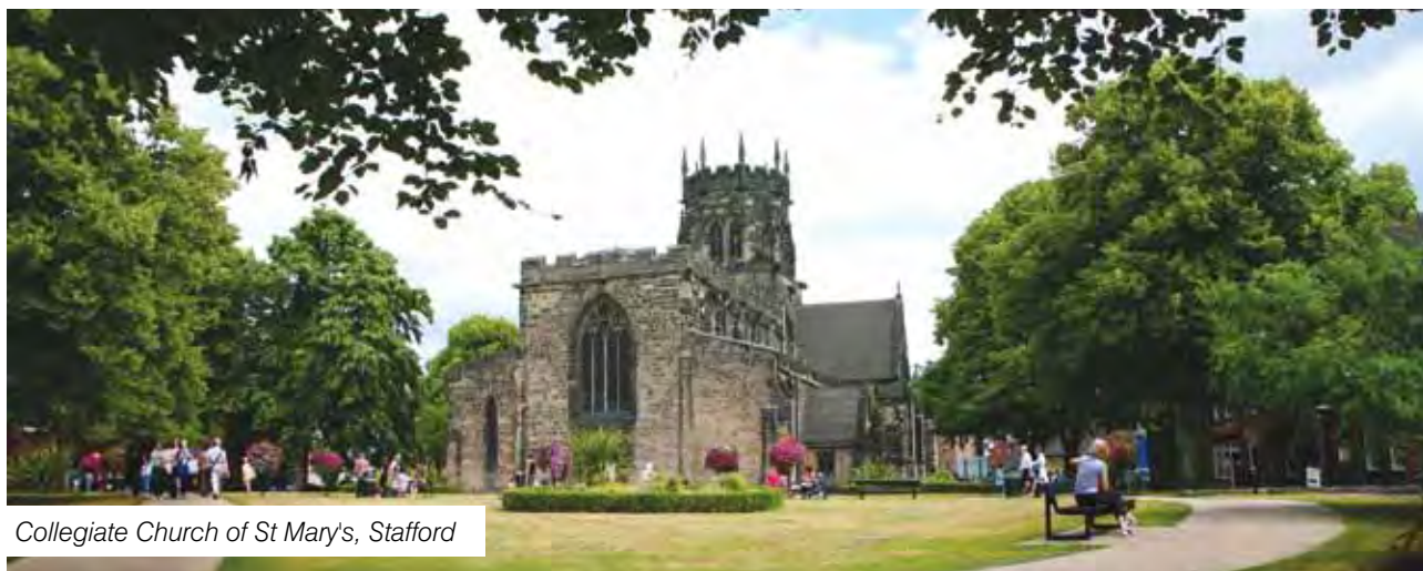
Collegiate Church of St Mary's, Stafford

More information can be found at www.staffordbc.gov.uk/green-infrastructure-strategy