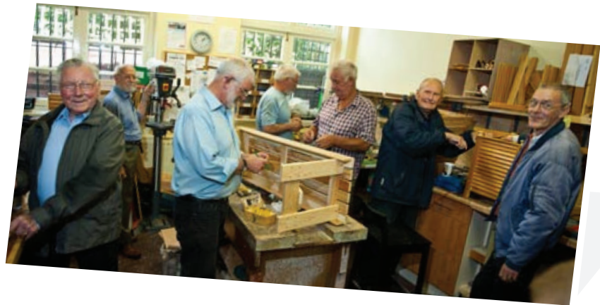
"MEN IN SHEDS" COMMUNITY PROGRAMME