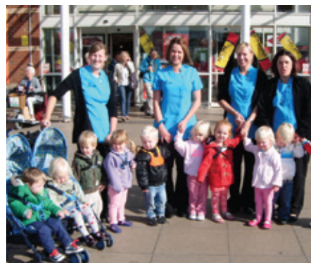
CS 1 - NURTURING HEALTH