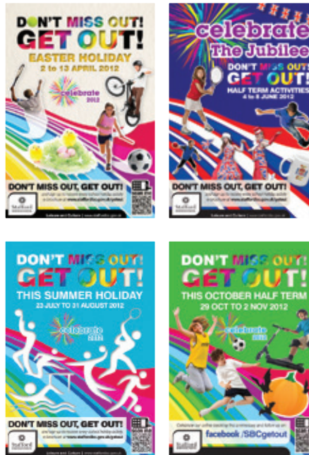
A SELECTION OF GET OUT BROCHURES

Wherever possible the sessions are organised in conjunction with local community groups in each area such as youth clubs and Parish Councils. The park consists of a variety of equipment such as a quarter pipe, box jumps and different sized ramps.